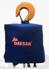
Hoist body weather cover