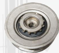
Overload protection device