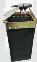
Stainless steel frame canvas chain box